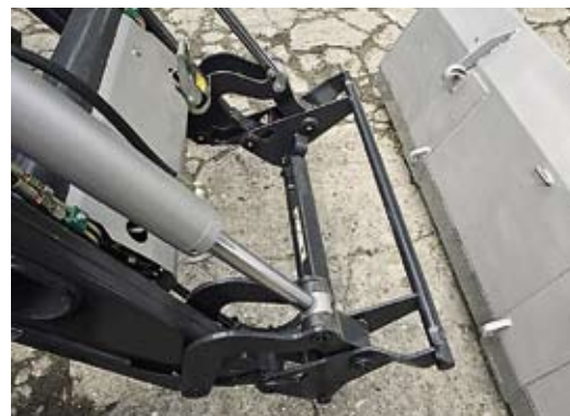
The operator can see the carriage during attachment by looking alongside the arms. The best approach, though, is to tip the frame completely.

lower cross-member. The Stoll claim is that the FZ set-up gives better cushioning of any light shocks while letting the suspension self-adjust to cope with heavier loads and bigger deflections. Suspension shut-off is manual with an electric option. So does the new Stoll approach work? Yes, on the whole, it does. Boom suspension is subjectively effective, both when travelling empty and with a considerable 1,000kg