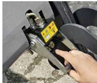
The multi-coupler unit for the standard third service has been moved for more convenient operation/better protection.

When it comes to boom suspension, Stoll is navigating uncharted waters. Not for it the traditional nitrogen spheres; instead, a horizontal piston arrangement, much like a hydraulic ram, is concealed within the arms'