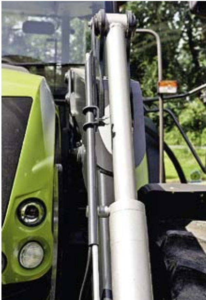
Attachment angle is shown by this telescopic rod, zeroed without having to resort to tools.