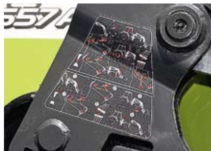
Instructions for loader attachment and removal are pretty clear.

lower cross-member. The Stoll claim is that the FZ set-up gives better cushioning of any light shocks while letting the suspension self-adjust to cope with heavier loads and bigger deflections. Suspension shut-off is manual with an electric option. So does the new Stoll approach work? Yes, on the whole, it does. Boom suspension is subjectively effective, both when travelling empty and with a considerable 1,000kg